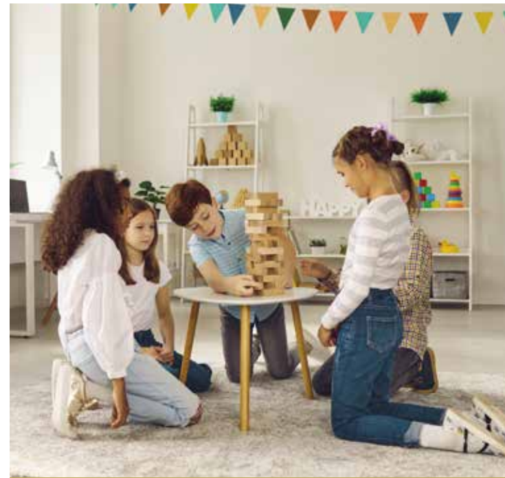
Kid's Activity Center