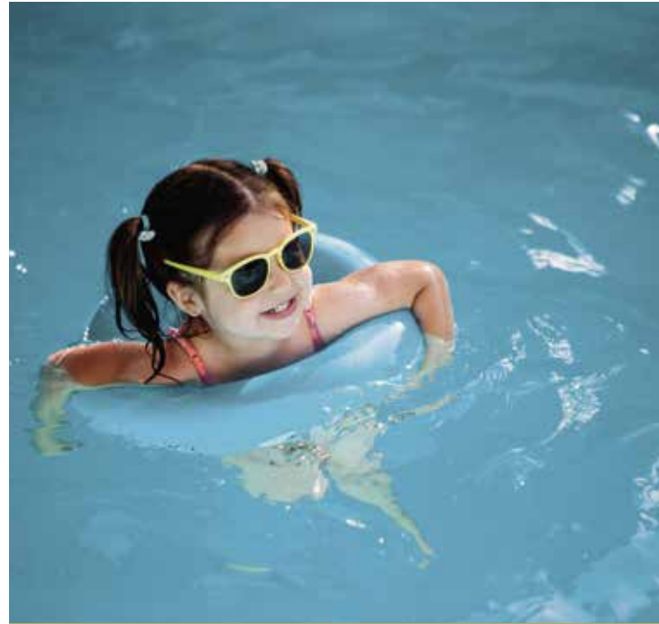
Lagoon Pool & Kid's Plunge Pool