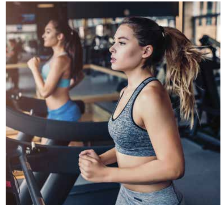
Fitness Club - Cardio