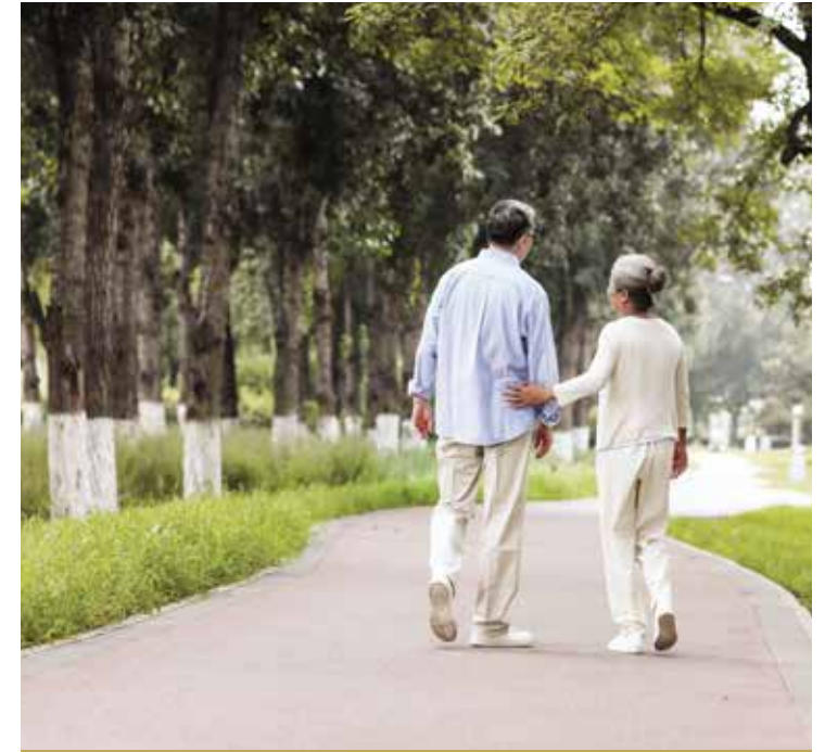
Nana Nani Park