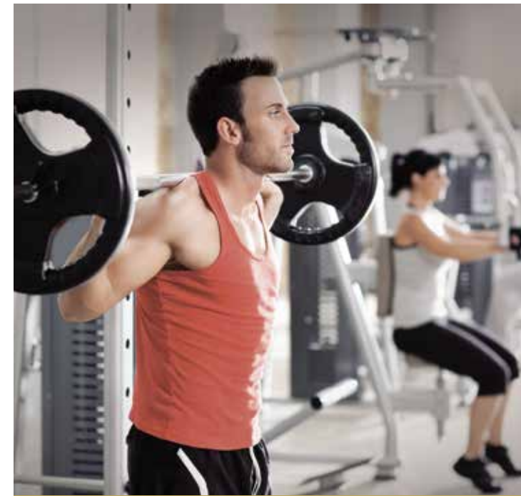
Fitness Club - Strength Training