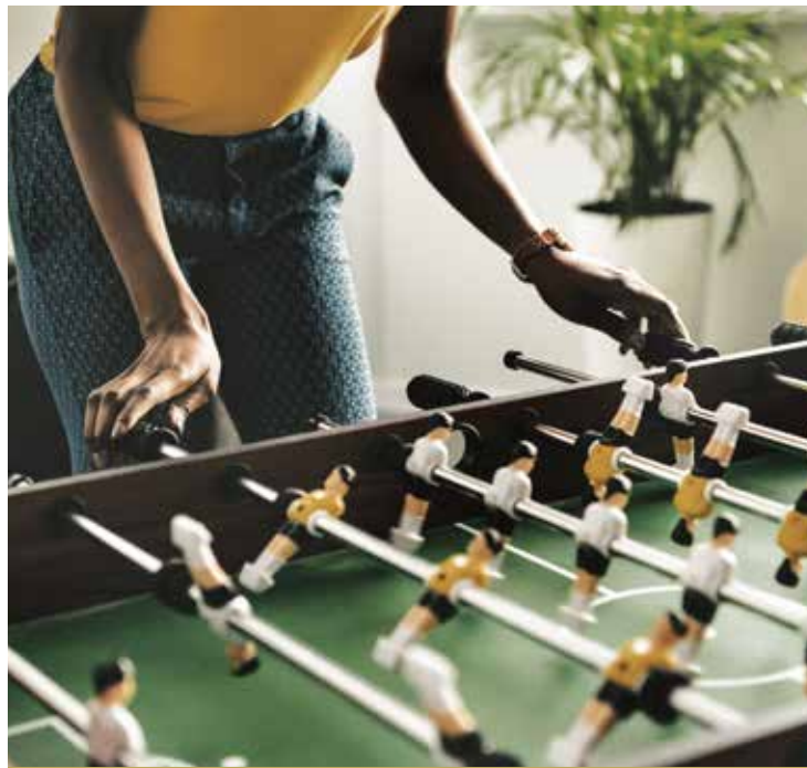
Indoor Games Arena