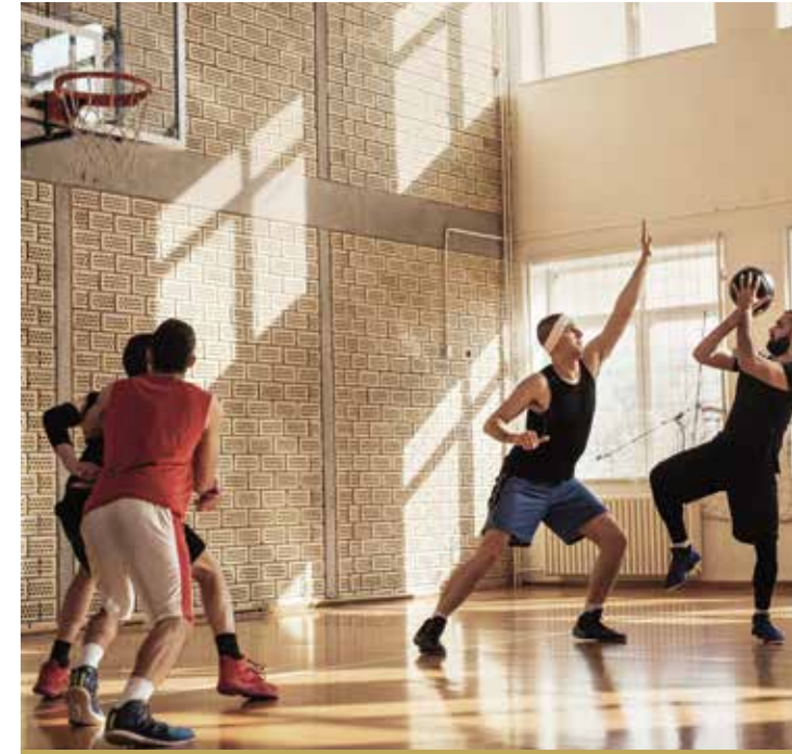
Indoor 3 on 3 Basketball Court