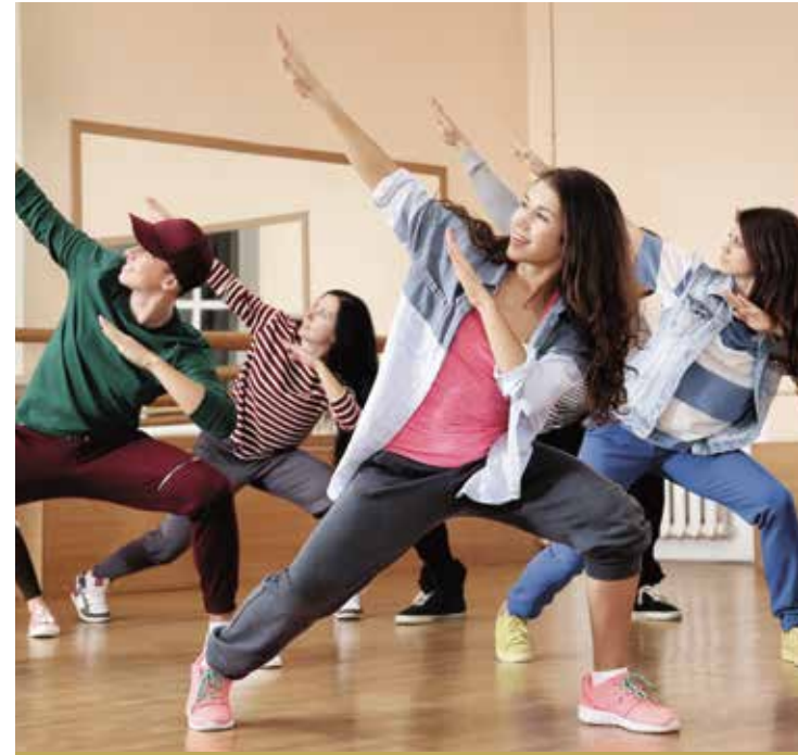
Dance Fitness Studio