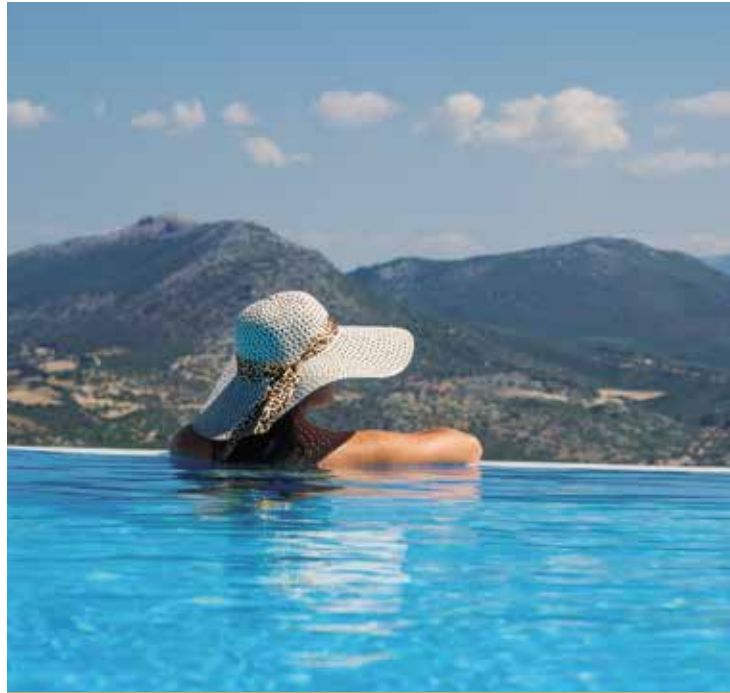
Infinity Edge Lap Pool