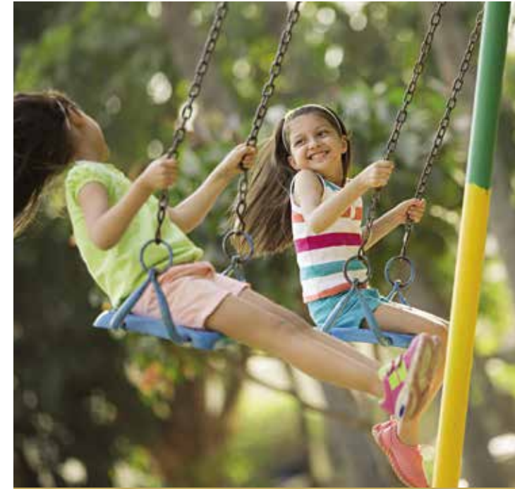
Kid's Play Zone